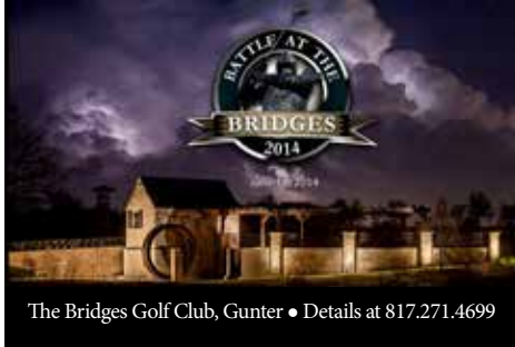
The Bridges Golf Club, Gunter • Details at 817.271.4699