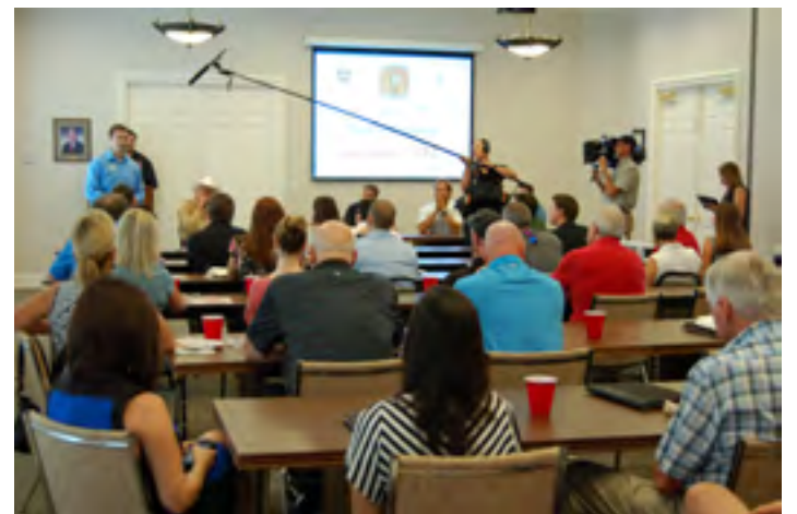
The Dallas BA's first Operation Finally Home project began in 2013 with a Town Hall meeting such as the one scheduled for March 20.