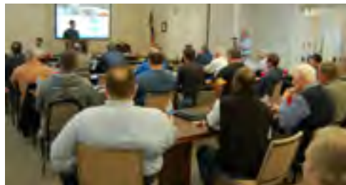
The Dallas BA officially kicked off its third Operation Finally Home project March 20 with a Town Hall meeting for members who want to do their part to build a custom mortgage-free home for a wounded veteran.