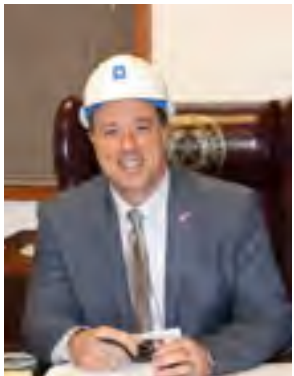
Rep. Pat Fallon models the TAB hardhat presented to him at Rally Day.