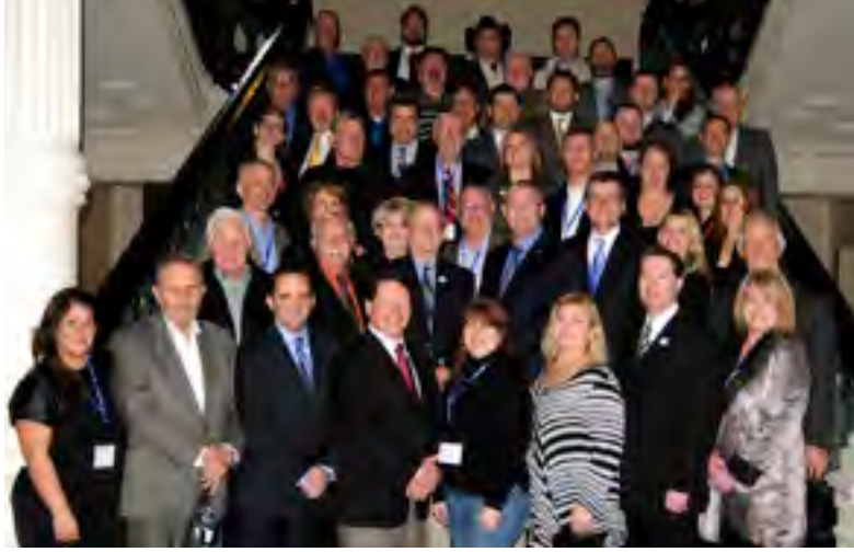
With almost 80 participants, the Dallas BA had one of the largest local contingents at Rally Day. A partial group gathered in the state Capitol for this photo.