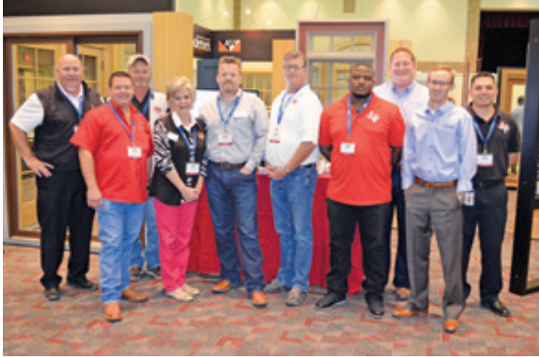
Thank you to the crew at Texas Door & Trim, whose title partnership of the Dallas Builders Show once again helped ensure a great show!