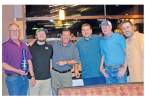
Division Champion: Metro East Division