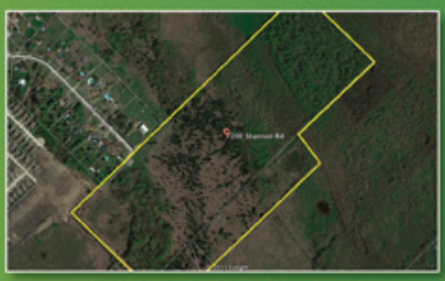
92 ACRES · MESQUITE, TX ZONED BUSINESS PARK $1,125,000