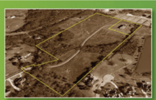
21 - 23 ACRES · LUCAS, TX LOVEJOY ISD, 2 ACRE LOTS