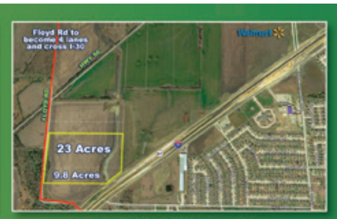
+/- 32.8 ACRES · ROYSE CITY I-30 FRONTAGE, COMMERCIAL $2,359,000