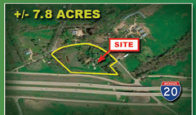
+/- 7.8 ACRES · MESQUITE, TX 1-20 FRONTAGE WITH HOME $650,000