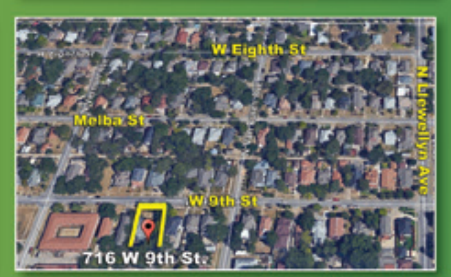
716 W 9TH BISHOP ARTS AREA ZONED MULTIFAMILY, 18,165' $450,000