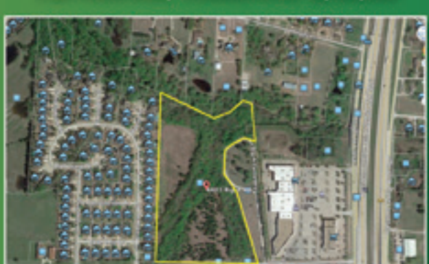
4401 BIG A RD. ROWLETT +/-14 ACRES, SFH 9,000' LOTS $1,200,000