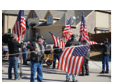
The North Texas Patriot Guard Riders provide a patriotic escort to the wounded veterans for all Operation FINALLY HOME ceremonies

Donations of materials and labor are needed. Visit DallasBuilders.com for details.