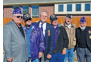
The Military Order of the Purple Heart was on hand.