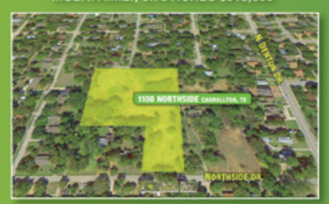
1108 NORTHSIDE, CARROLLTON +/- 4.33 ACRES, AG $1,100,000