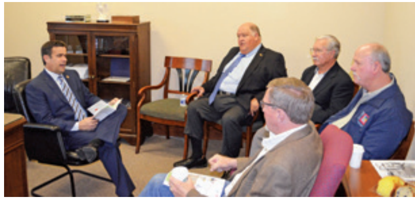
Association members meet with Congressman John Ratcliffe about regulatory reform.