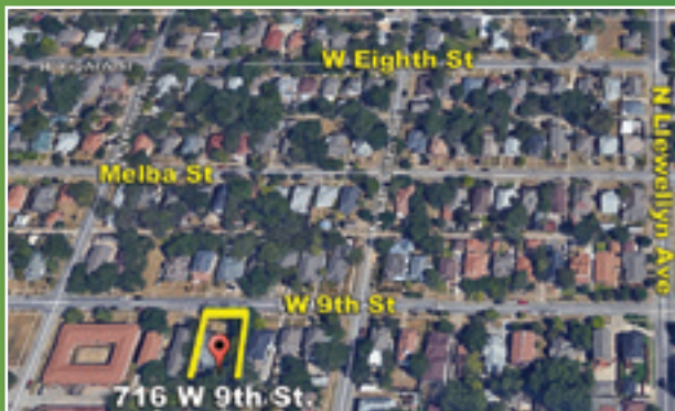
716 W 9TH BISHOP ARTS AREA 18,165' ZONED MULTIFAMILY, $450,000