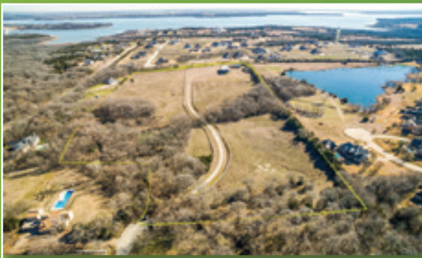
23 ACRES • LUCAS LOVEJOY ISD, 2 ACRE LOTS