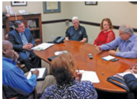
Dallas BA members discuss small business health-care relief with Congressman Michael Burgess.