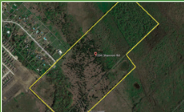
7200 SHANNON - 92 ACRES • MESQUITE ZONED BUSINESS PARK $1,125,000