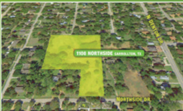
1108 NORTHSIDE, CARROLLTON +/- 4.33 ACRES, AG $1,100,000