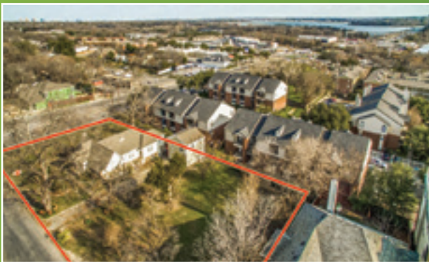
CORONADO AVE. DALLAS MF2 30,250 SFT - LAKE VIEWS FROM 42'