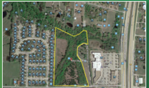
4401 BIG A RD. ROWLETT +/- 14 ACRES, TRYING TOWNHOME REZONE