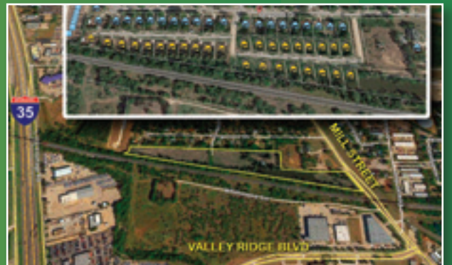
1205 N MILLS • LEWISVILLE SINGLE FAMILY/COMMERCIAL • WILL SUBDIVIDE