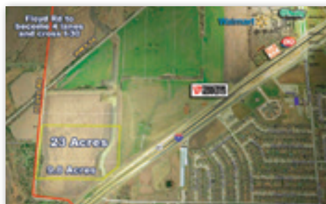
FLOYD RD & I-30 • ROYSE CITY COMMERCIAL +/- 32.8 ACRES $2,359,000