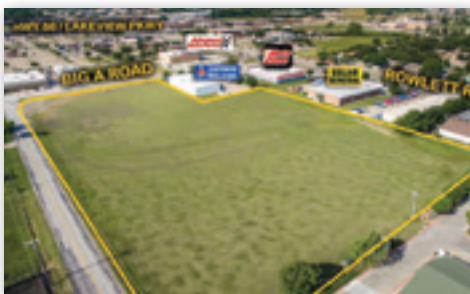
5610 BIG A ROAD, ROWLETT HOSPITAL/OFFICE/RETAIL 4.52 ACRES $699K