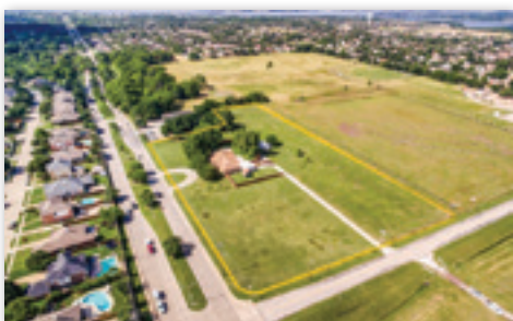
4205 DALROCK +/- 5.4 AC. • ROWLETT SR. LIVING, OFFICE, RETAIL • $1,235,000

Education classes are presented in partnership with Title Partner StrucSure Home Warranty.