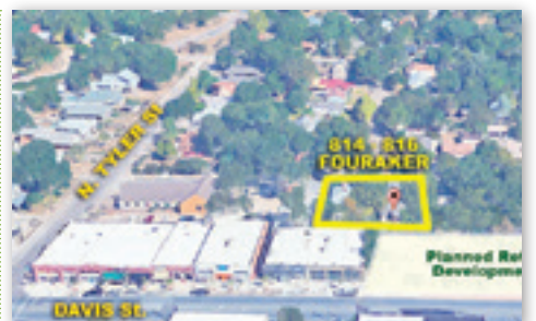
814-816 FOURAKER, BISHOP ARTS MF2 • OFFICE • RETAIL • 100' X 100' $536K