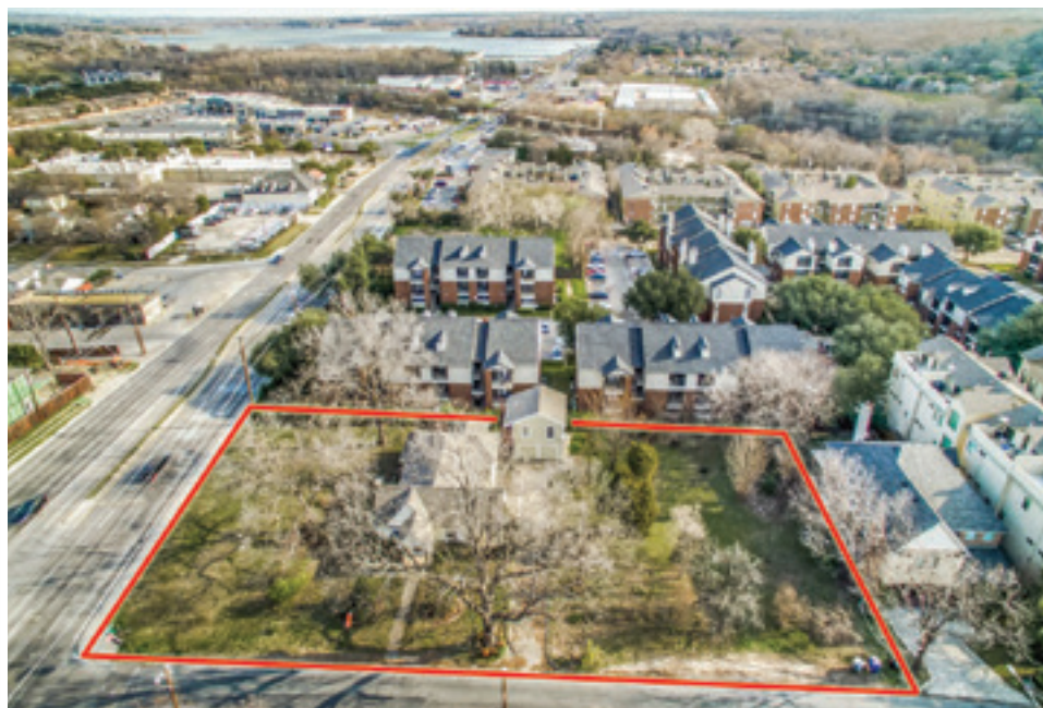
7427 CORONADO AVE (WHITE ROCK LAKE AREA) • ZONED MULTIFAMILY +/- 30,265 SFT • 36' MAX HEIGHT • +/- 235' X 124' - CALL FOR PRICING