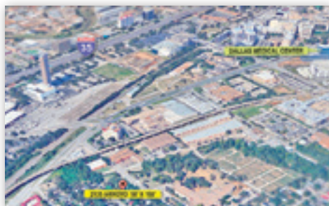
2135 ARROYO, DALLAS • MF2 MEDICAL AREA MF2 SITE 50' X 168' • $300K