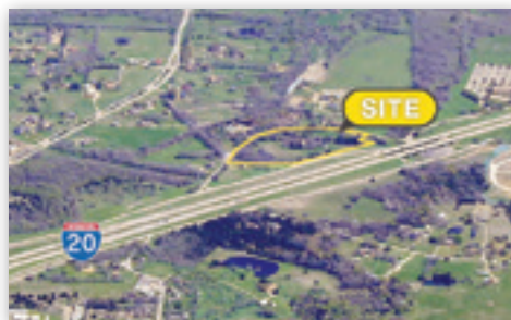
5757 LUMLEY RD, MESQUITE HOME +/- 8 ACRES I-20 FRONTAGE $650K