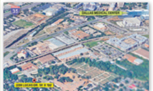
2200 LUCAS, DALLAS • MF2 • 50' X 100' MEDICAL AREA DUPLEX SITE • $210K