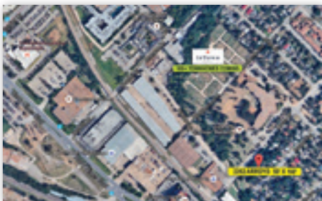
2202 ARROYO, DALLAS • MF2 MEDICAL AREA • 50' X 150' $265K