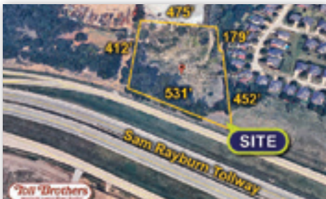
600 N DENTON TAP RD • $1,600,000 +/- 5.6 ACRES ON HWY 121 FRONTAGE