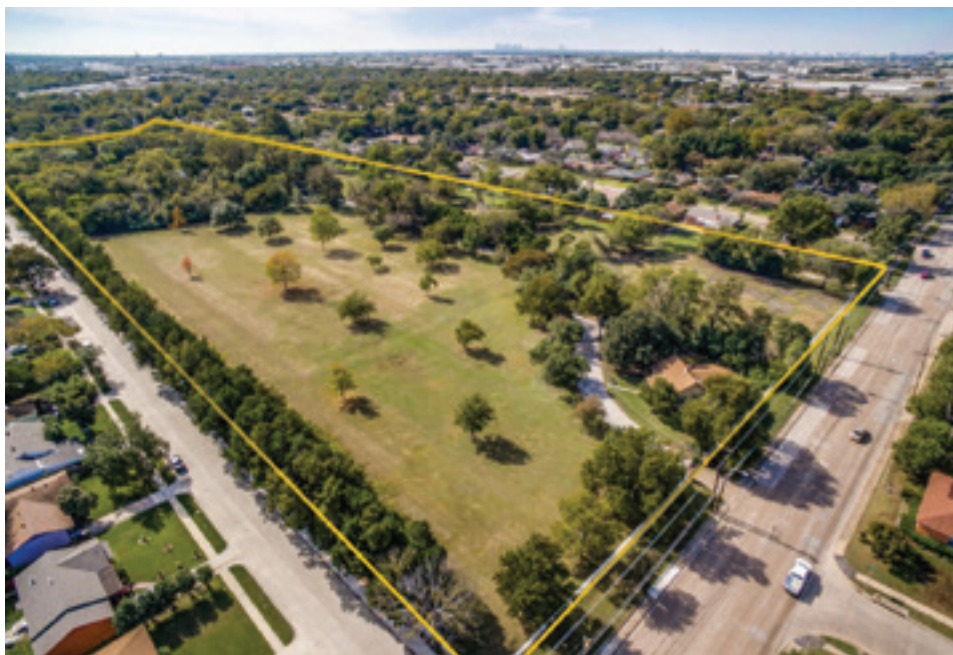
4020 W MILLER RD, GARLAND · REDEVELOPMENT SITE ±14.9 ACRES · CALL FOR PRICE