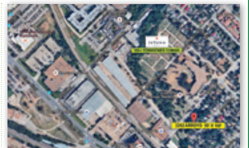
2202 - 2206 ARROYO, DALLAS · MF2 DALLAS MEDICAL AREA · 100' X 150' $550K