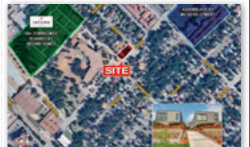
4501 AFTON RD · MF2 ± 90' X 150' BEST OFFER