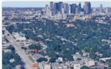
5223 COLUMBIA AVE · MF2 ± 65' X 170' BEST OFFER