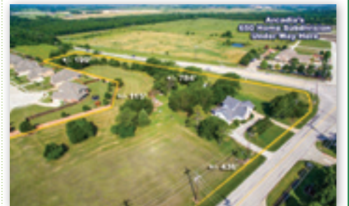
CHIESA / LIBERTY GROVE ± 5.5 AC. SR. LIVING, OFFICE, RETAIL · $1,100,000

For Specific Needs, Contact TROY CORMAN 214-690-9682 troy@t2realestate.com