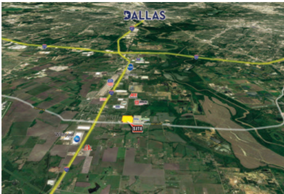
±69 ACRES, WILMER TX PROPOSED INDUSTRIAL · CALL FOR PRICE