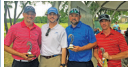
The Integrus Solutions team won third place honors.