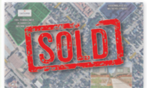
4501 AFTON RD, DALLAS • MF2 ± 90' X 150' SOLD!