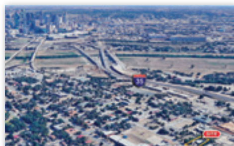
312 N LANCASTER, DALLAS ±100' X 183' UP TO 5 STORIES $450K