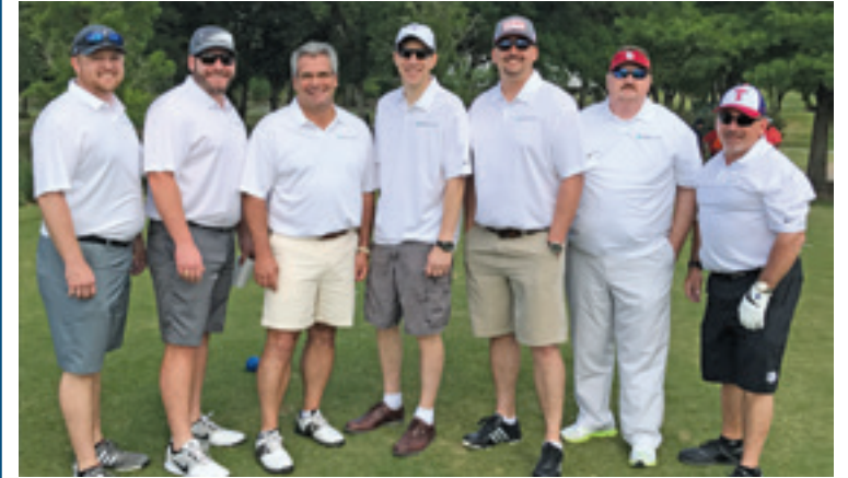
Players from Shreve Land Constructors claimed both first and second place victories at the tournament held May 12 at Luna Vista Golf Course in Dallas.