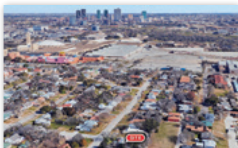
3851 LAFAYETTE, FORT WORTH MUSEUM AREA • BUILD UP TO 3 UNITS $295K