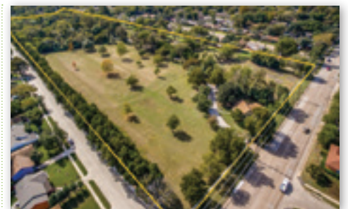
2040 W MILLER RD, GARLAND ±15 ACRES • SINGLE FAMILY