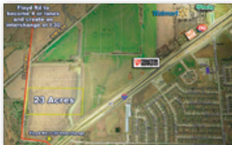
FLOYD RD, ROYSE CITY ± 23 ACRES BEST OFFER