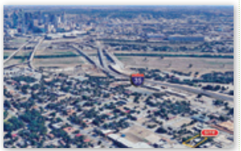
312 N LANCASTER, DALLAS ±100' X 183' UP TO 5 STORIES $450K