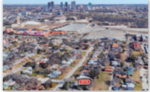
3851 LAFAYETTE, FORT WORTH MUSEUM AREA · BUILD UP TO 3 UNITS $295K