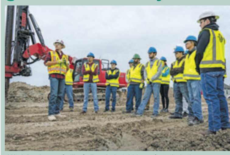
Work begins on Collin College's 340,000-sq.-ft. technical campus.