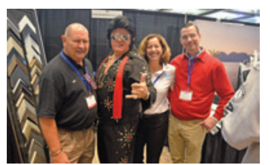
Thank You to Dallas Builders Show Partners