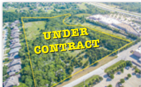
4401 BIG A RD, ROWLETT ± 15 ACRES BEST OFFER