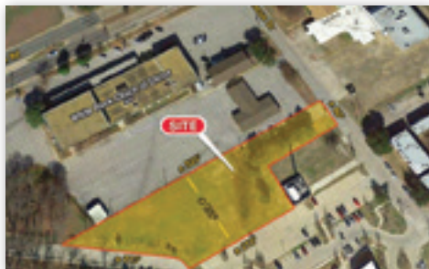
9220 FERGUSON RD, DALLAS ±50,000 SFT $550K