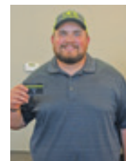
Masters Course, Longest Drive: Ben Hogan