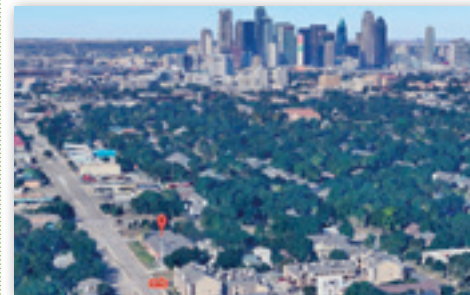
5223 COLUMBIA, DALLAS MF2 ±65' X 170' $399K