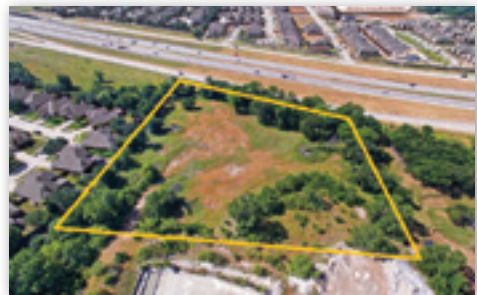
600 N DENTON TAP RD. COPPELL TX ±5.3 ACRES • TX - $1,600,000