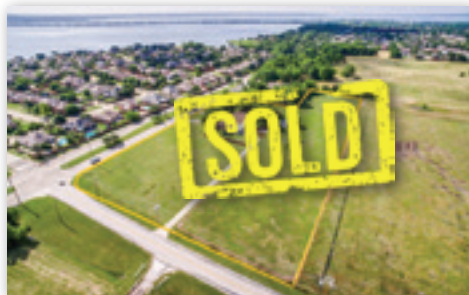
4205 DALROCK, ROWLETT ±100' X 183' UP TO 5 STORIES $450K