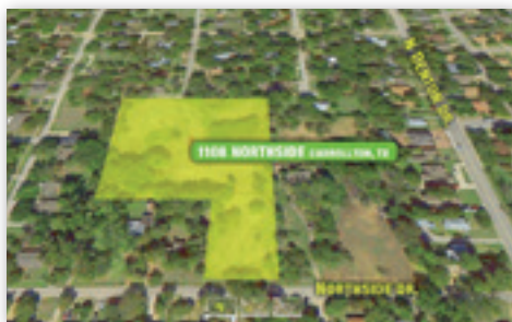
1108 NORTHSIDE RD, CARROLLTON ± 4.33 ACRES $1.3M