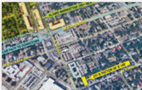
311 N PATTON, BISHOP ARTS, DALLAS 50' X 140' MULTIFAMILY $200K