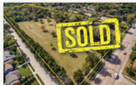
2040 W MILLER RD, GARLAND ±15 ACRES • SINGLE FAMILY