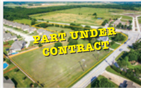
CHIESA / LIBERTY GROVE ROWLETT ±5.5 AC. WILL SUBDIVIDE