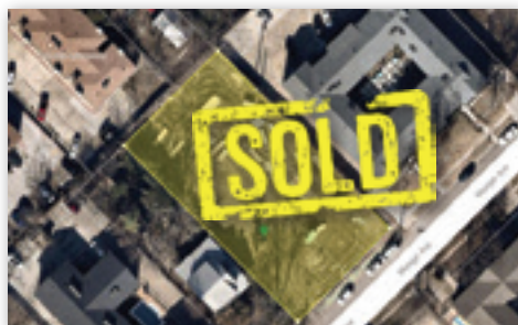
4621 - 4625 MUNGER, DALLAS MF2 ±110' X 200' SOLD OFF MARKET