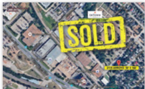
2106, 2110, 2200, & 2135 ARROYO 4 LOTS ZONED MF2