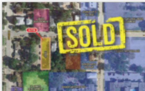
424 W 9TH, BISHOP ARTS, DALLAS ±50' X 195' SOLD OFF MARKET

For Specific Needs, Contact t2 Real Estate