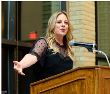
TV Personality Amy Vanderloef served as mistress of ceremonies for the Installation of Leadership gala at Las Colinas Country Club.