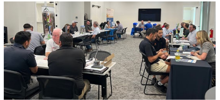
Ten builders meet with representatives of 10 associate members in 10-minute rotations at the Sept. 22 Speed Networking.