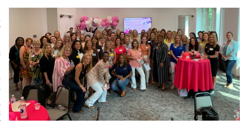
Members gather for a group photo at the June 9 Wine & Sign event hosted by the Association's Professional Women in Building Council.