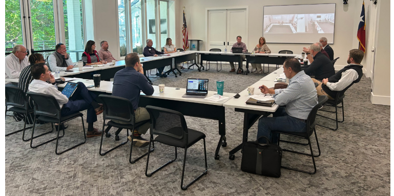
Dallas BA member builders, developers and associates at Government Relations Committee meeting.