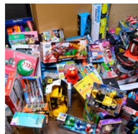
(Left) The 2022 MFBC Board of Directors continued the council's impressive tradition of community service. (Right) 100+ toys were also collected for the Samaritan Inn's Santa Workshop program.