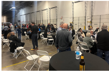
Almost 150 members and guests attended the Feb. 23 After Hours hosted by Corradi USA.