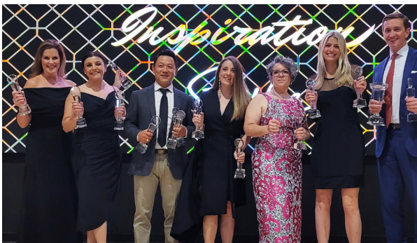
Hillwood Communities garnered Developer of the Year and People’s Choice Community of the Year honors.

A complete list of award winners and a photo gallery can be found at McSAM Awards.com .