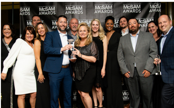
The People’s Choice Builder of the Year award went to David Weekley Homes.