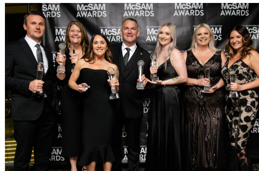
Homes by J. Anthony was named Custom Builder of the Year.