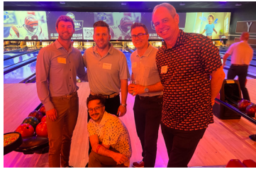
Pape-Dawson Engineers Team