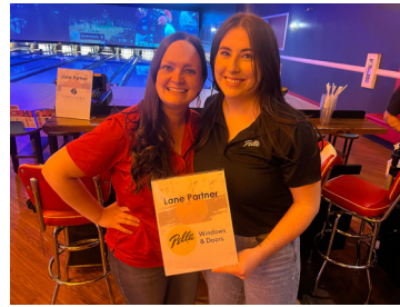
Pella Windows & Doors Team