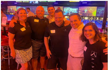
The Alair Homes Team

A presentation to the college will be held in June at its Technical Campus in Allen.