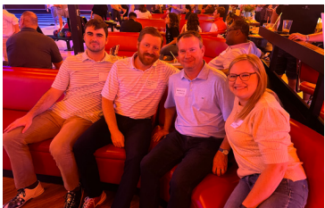
K Hovnanian Homes Team