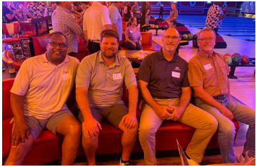
Acme Brick Team