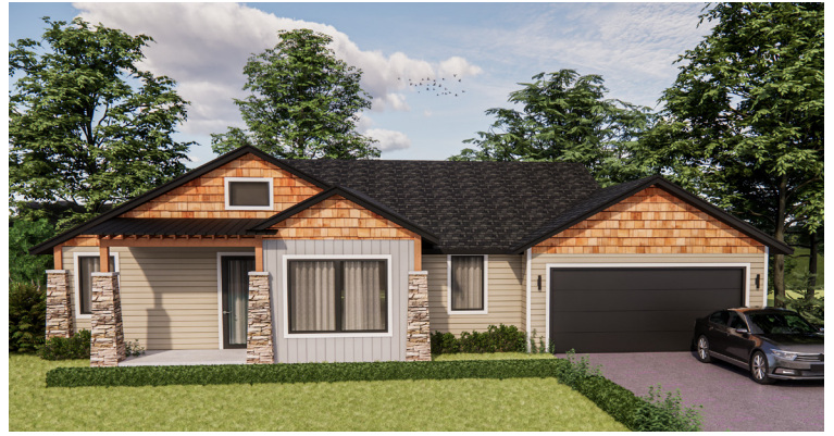
Garvey Homes will serve as builder captain for the Association's ninth Operation Finally Home project: a 2,242-sq.-ft. home with ADA features in Irving.