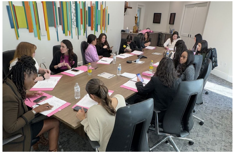
Students from the Collin College Construction Management Program meet their Professional Women in Business mentors at Association of Offices in January.